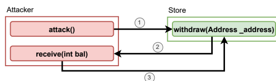
Figure 2: Call graph for a cross-function reentrancy example

We now present an simple example of single function reentrancy, where a function within the contract can be called recursively before the completion of its initial execution. Additionally, in [5], we show how the type system effectively prevents not only single-function reentrancy but also cross-function and cross-contract reentrancy.